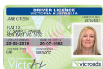
Australian driver licence