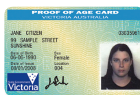
Proof of age card