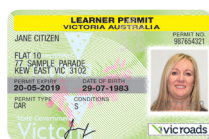
Victorian learner permit