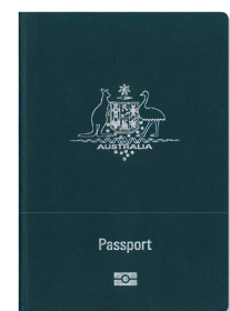
Australian or foreign passport