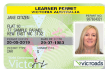
Victorian learner permit