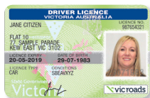
Australian driver licence