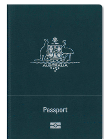
Australian or foreign passport